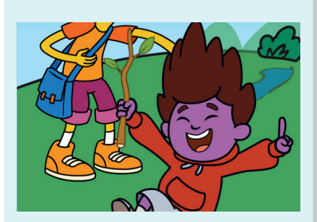
After playing outside