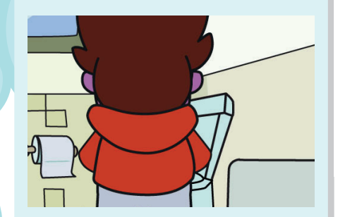
After going to the toilet

He's made a guide to show you some examples of when to wash your hands.