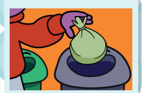
After handling rubbish