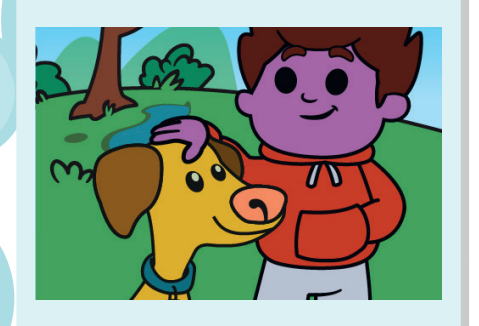
After touching an animal