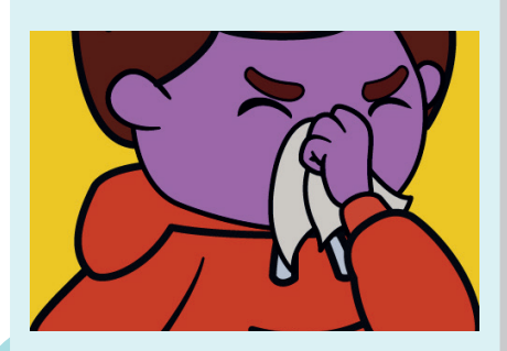
After coughing, sneezing or blowing your nose