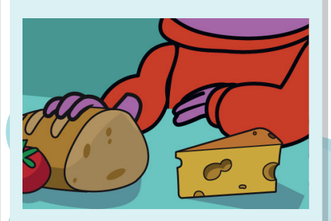
Before and after preparing food