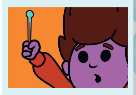
Before and after taking care of someone who's sick